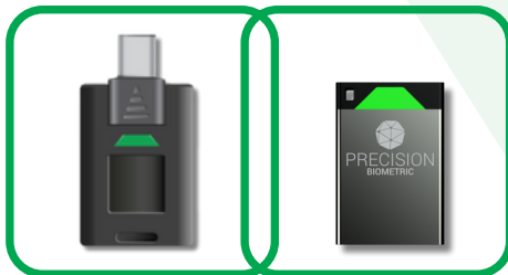
PK1101 FIDO2L2 Biometric